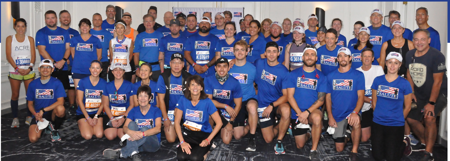
SALUTE's Chicago Marathon team persevered raising over $150,000 for Veteran Assistance Programs.

By summer, over 100 charity runners had registered with TEAM SALUTE for the Bank of America Chicago Marathon, many of whom had maintained their commitment from the cancelled 2020 race. After 18 weeks of training, the long awaited emergence from shutdown was celebrated over 26.2 miles of city streets. SALUTE's biggest fundraiser of the year was BACK!